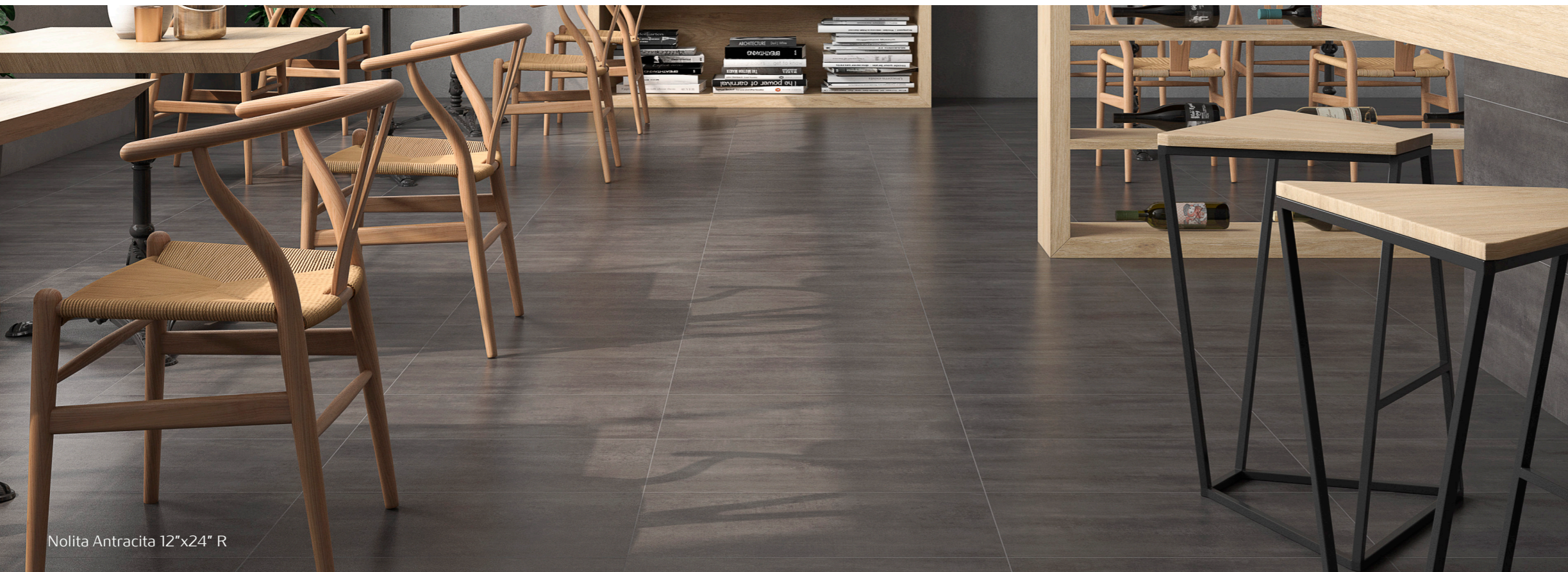
Nolita Antracita 12"x24" R