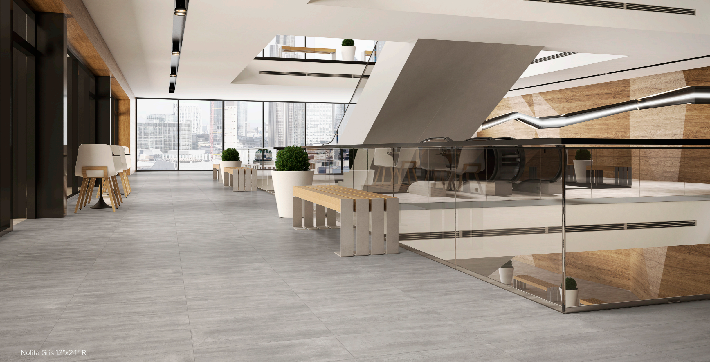
Nolita Gris 12"x24" R