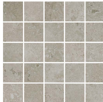
89132/M12 Sand 25pc