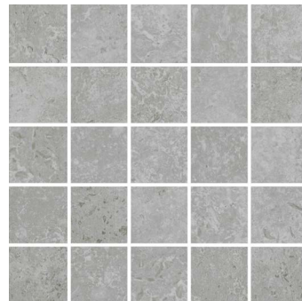
89103/M12 Quarry 25pc