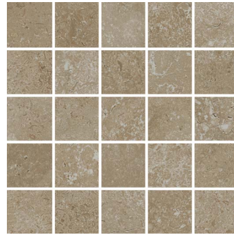
89123/M12 Clay 25pc