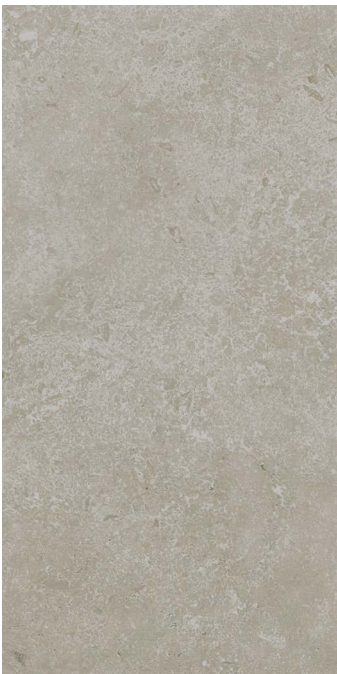
89132 12x24 Sand