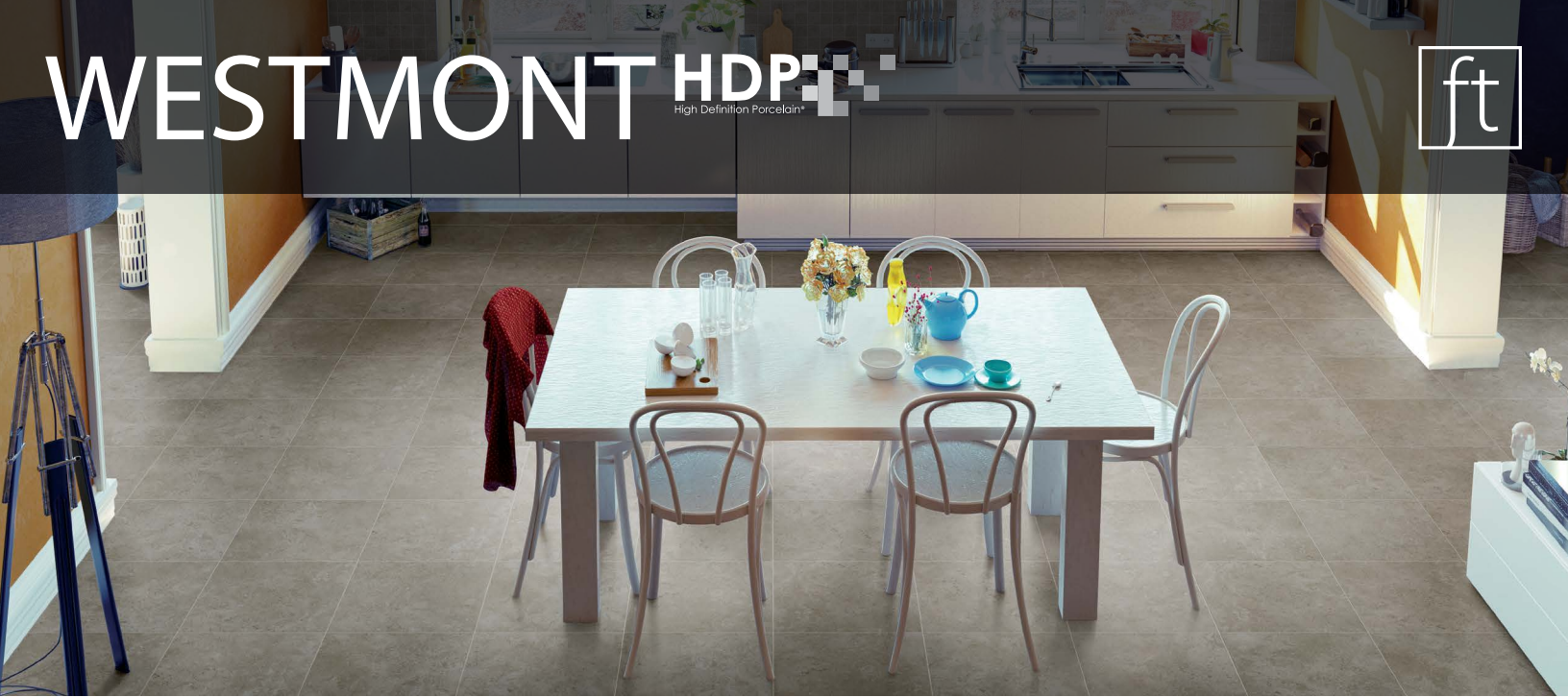
above: 89132 12x12 Sand