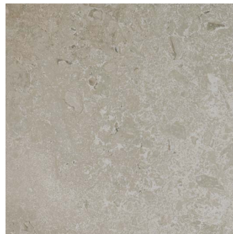
89132 12x12 Sand