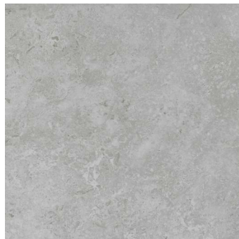
89103 12x12 Quarry