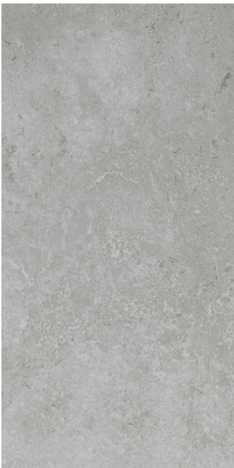
89103 12x24 Quarry