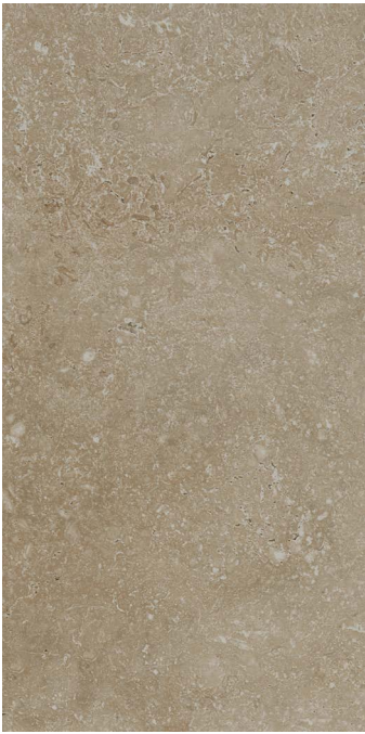
89123 12x24 Clay