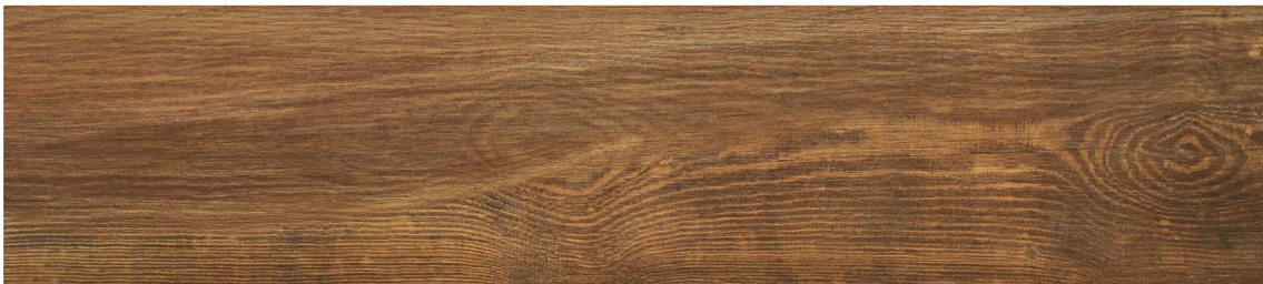
28327 8x36 Chestnut