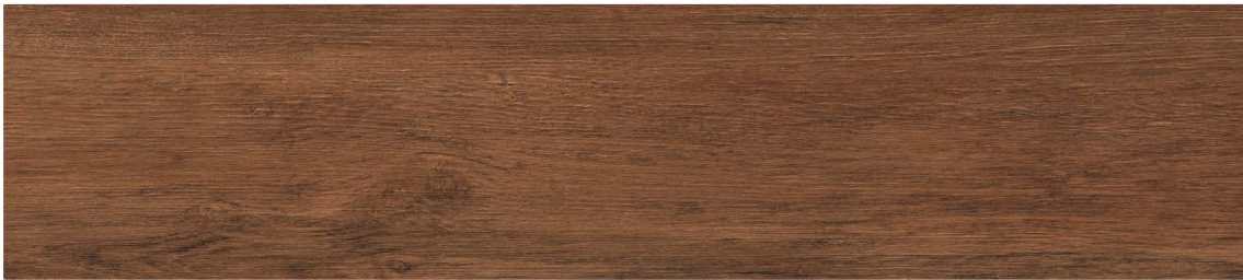
28325 8x36 Burl