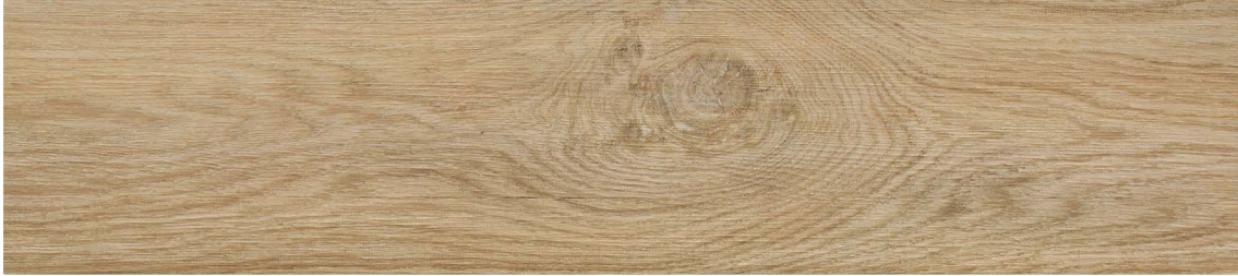
28338 8x36 Fir