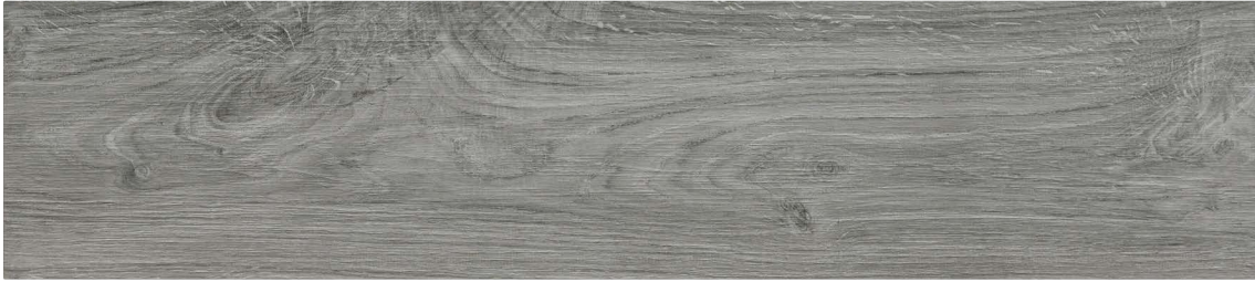
28315 8x36 Ash