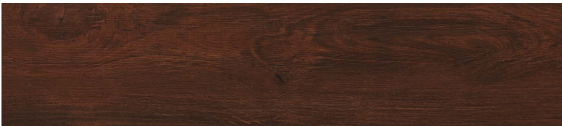
28378 8x36 Cherry