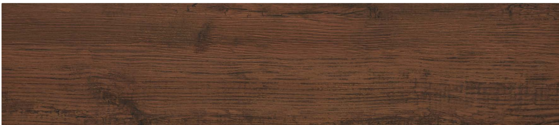
28395 8x36 Mahogany