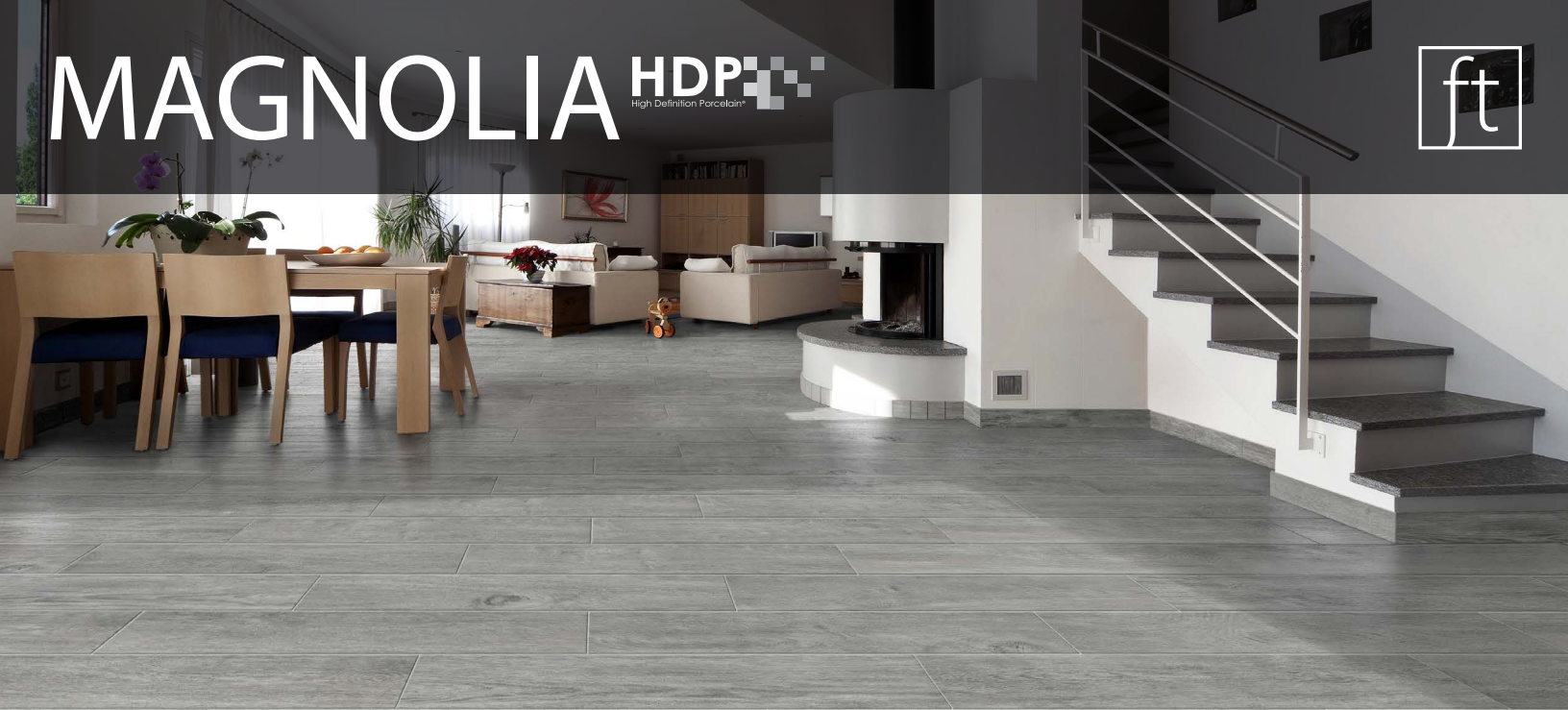
above: 28315 8x36 Ash