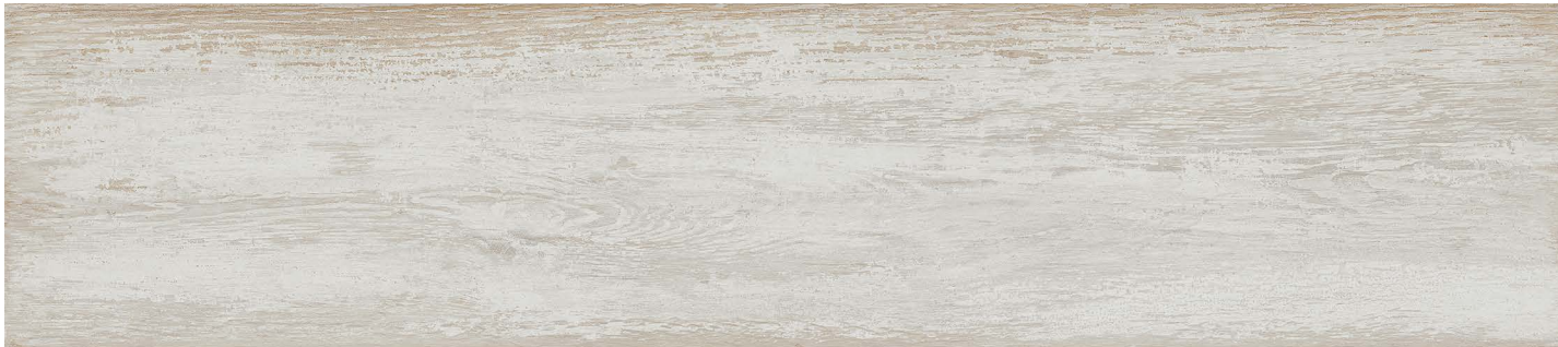
LCL10 8x36 Bistro