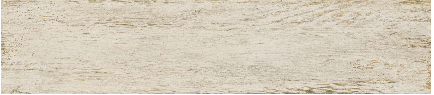
LCL30 8x36 Café