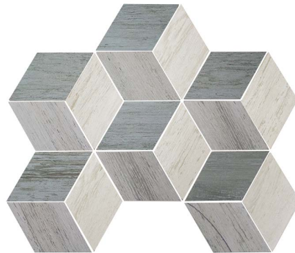
LCL145/M12CUBE Cool Mix Cube (Lounge, Bistro, and Market)