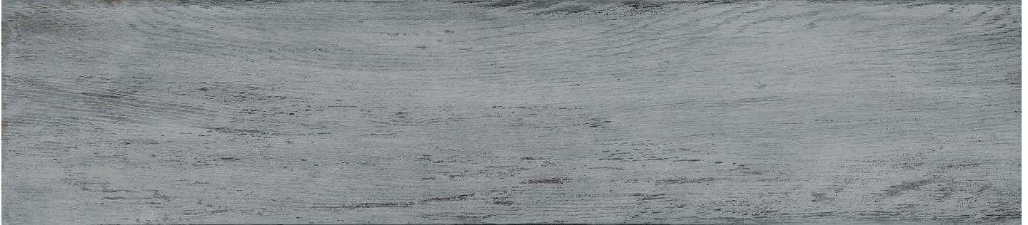
LCL50 8x36 Lounge