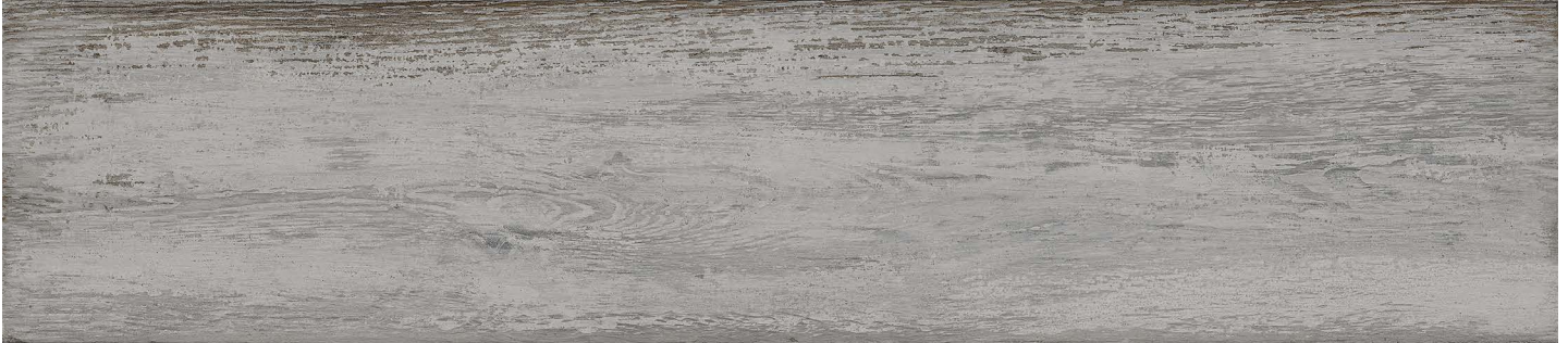
LCL40 8x36 Market