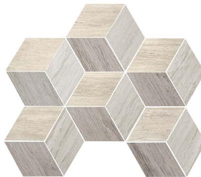
LCL123/M12CUBE Warm Mix Cube (Café, Bistro, and Tavern)