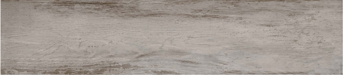
LCL20 8x36 Tavern