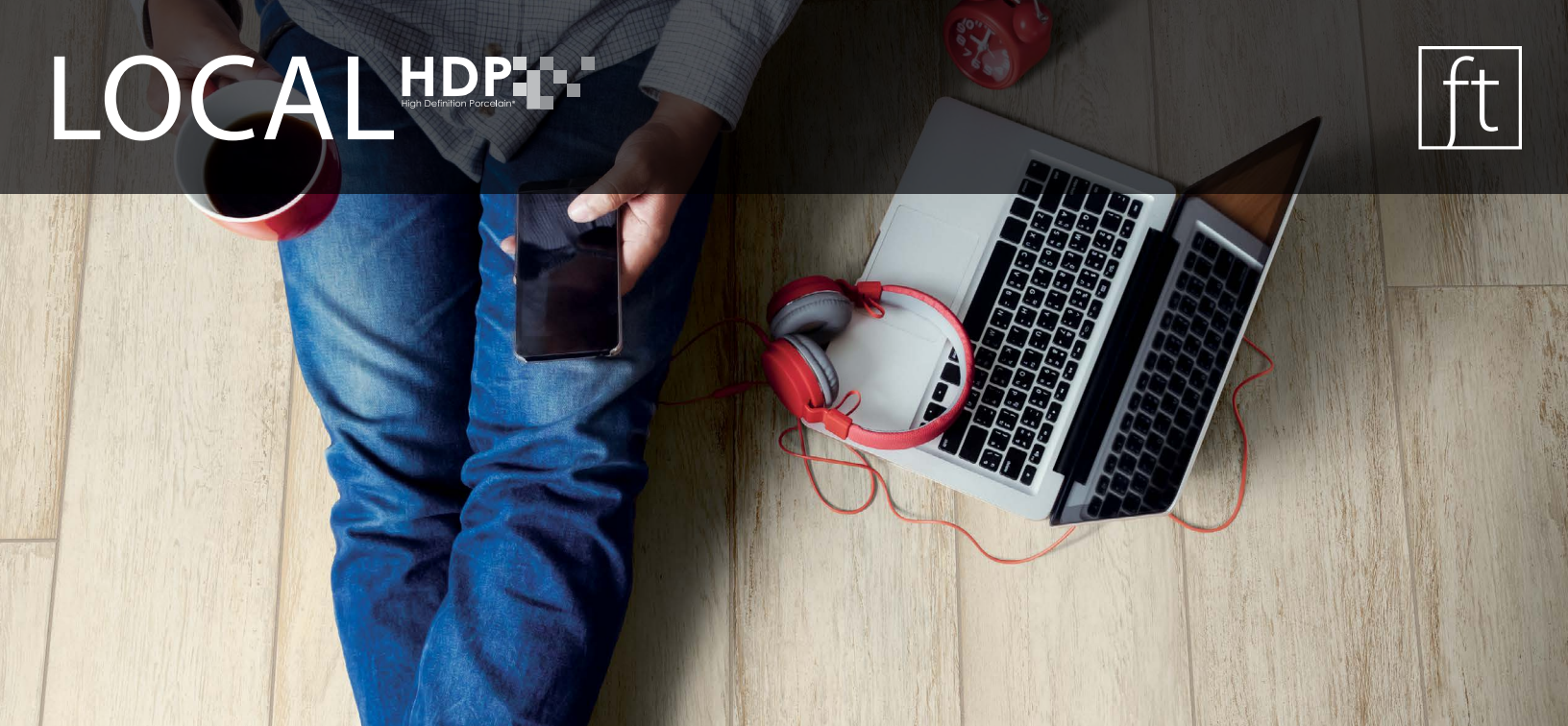
above: LCL30 8x36 Café