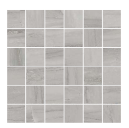
ENC30/M122 36pc Mosaic (matte only)