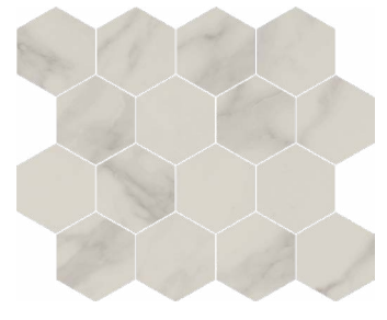
ENC10/M3x3HEX Matte ENC1P/M3x3HEX Polished (not shown) Hexagon Mosaic