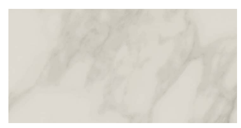
ENC10 12x24 Matte ENC1P 12x24 Polished (not shown)