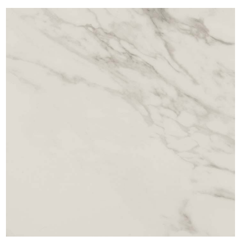
ENC10 24x24 Matte ENC1P 24x24 Polished (not shown)