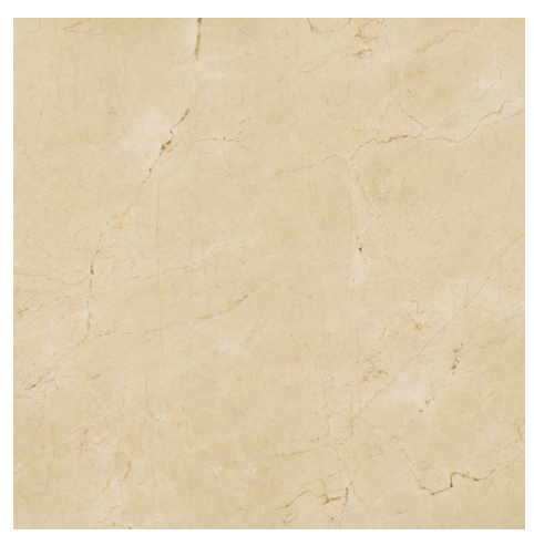
ENC20 24x24 Matte ENC2P 24x24 Polished (not shown)