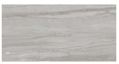
ENC30 12x24 Matte ENC3P 12x24 Polished (not shown)