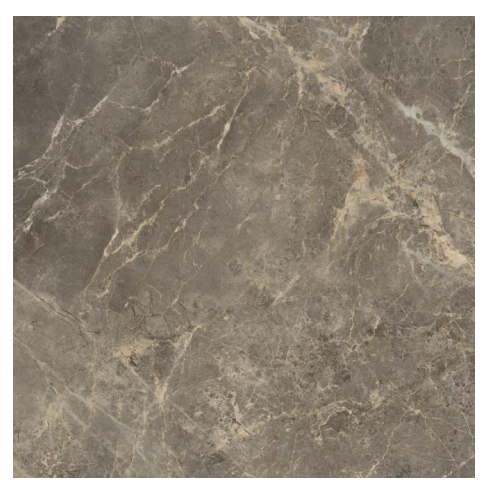
ENC40 24x24 Matte ENC4P 24x24 Polished (not shown)