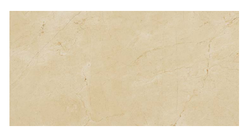
ENC20 12x24 Matte ENC2P 12x24 Polished (not shown)