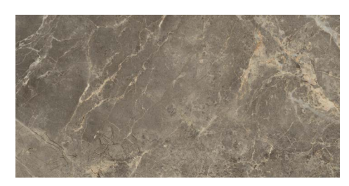
ENC40 12x24 Matte ENC4P 12x24 Polished (not shown)