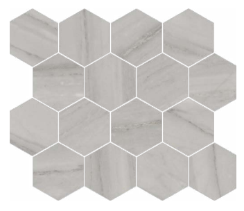
ENC30/M3x3HEX Matte ENC3P/M3x3HEX Polished (not shown) Hexagon Mosaic