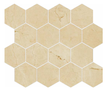
ENC20/M3x3HEX Matte ENC2P/M3x3HEX Polished (not shown) Hexagon Mosaic