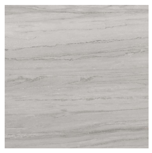
ENC30 24x24 Matte ENC3P 24x24 Polished (not shown)