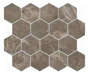
ENC40/M3x3HEX Matte ENC4P/M3x3HEX Polished (not shown) Hexagon Mosaic