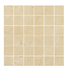
ENC20/M122 36pc Mosaic (matte only)