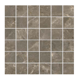
ENC40/M122 36pc Mosaic (matte only)