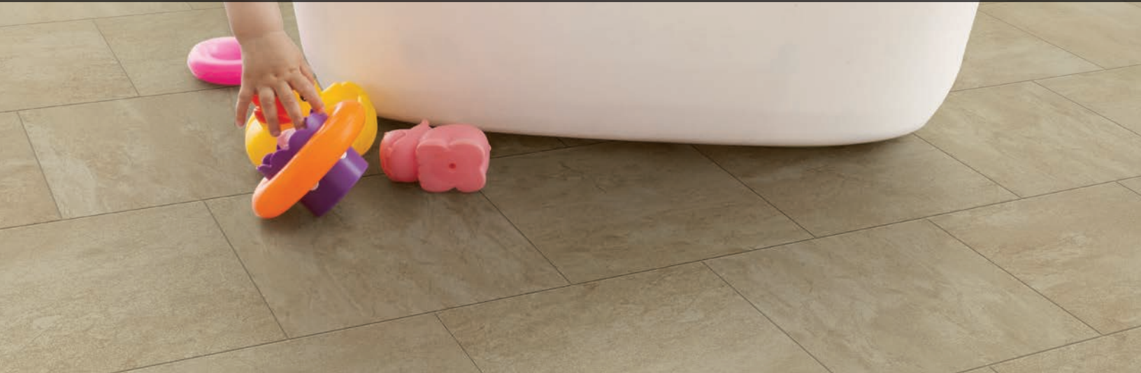
above: 27230 12x12 Wheat