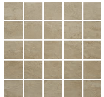
27230/M12 Wheat 25pc Mosaic