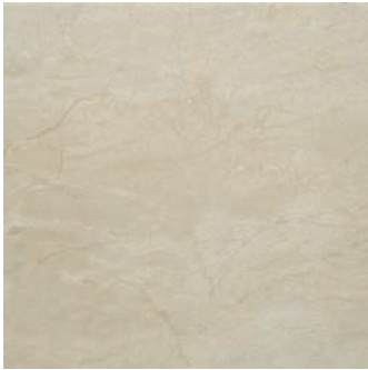
27202 12x12 Biscuit