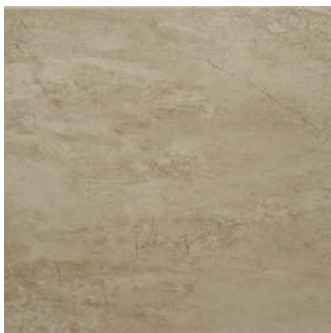
27230 12x12 Wheat