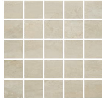
27202/M12 Biscuit 25pc Mosaic