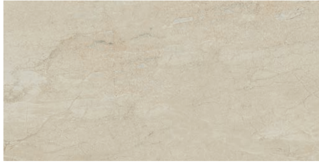
27202 12x24 Biscuit