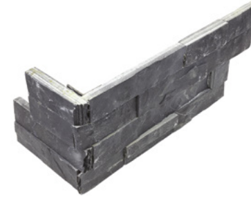
6 x 18 in / 15 x 45 cm Assembled Corner 5004-0010-0