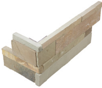
6 x 18 in / 15 x 45 cm Assembled Corner 5004-0001-0