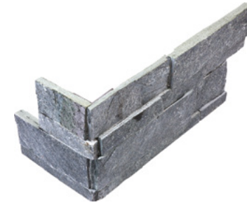
6 x 18 in / 15 x 45 cm Assembled Corner 5004-0003-0