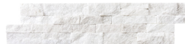
6 x 24 in / 15 x 60 cm 5004-0011-0