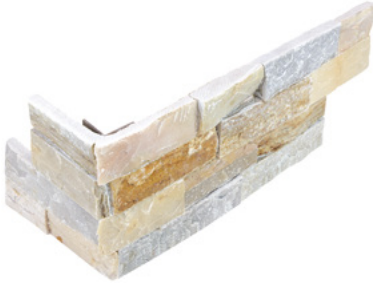
6 x 18 in / 15 x 45 cm Assembled Corner 5004-0006-0