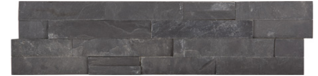
6 x 24 in / 15 x 60 cm Corner Panel 5004-0009-0