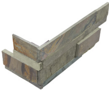
6 x 18 in / 15 x 45 cm Assembled Corner 5004-0015-0