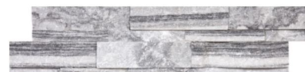
6 x 24 in / 15 x 60 cm 5004-0016-0