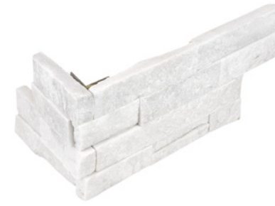
6 x 18 in / 15 x 45 cm Assembled Corner 5004-0013-0