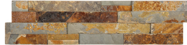
6 x 24 in / 15 x 60 cm Corner Panel 5004-0019-0