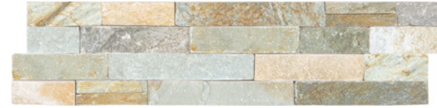
6 x 24 in / 15 x 60 cm Corner Panel 5004-0005-0