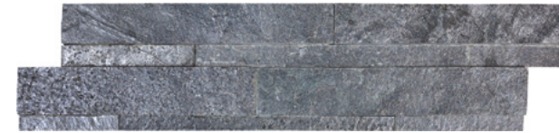
6 x 24 in / 15 x 60 cm 5004-0002-0