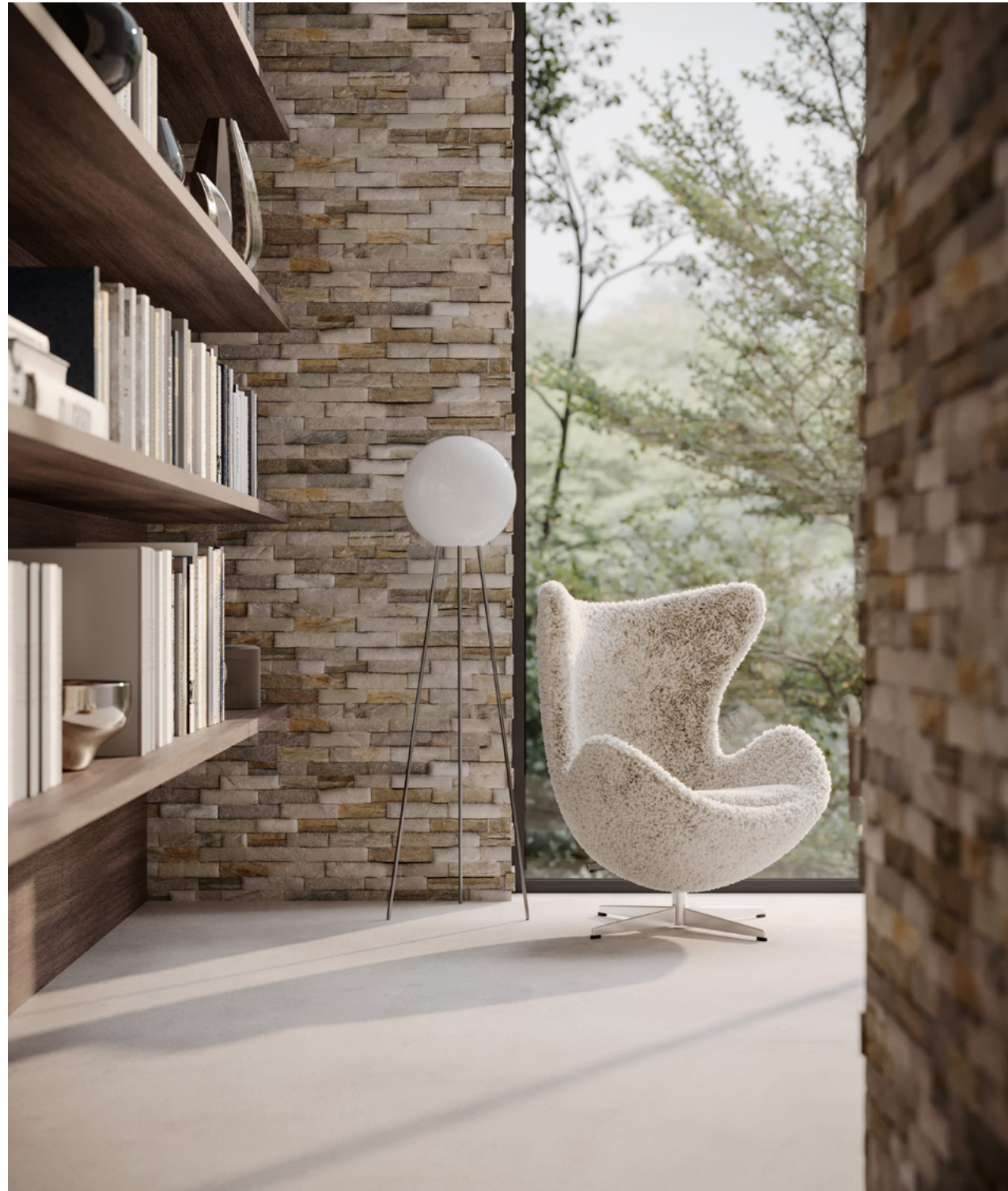
6 x 24 in / 15 x 60 cm Ledger Stone Beachwalk Split Face Quartzite Panel