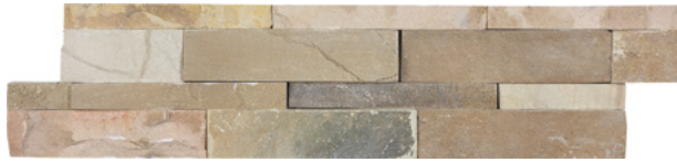
6 x 24 in / 15 x 60 cm 5004-0000-0