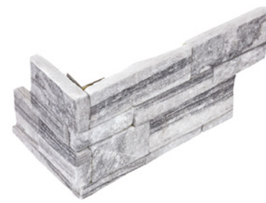
6 x 18 in / 15 x 45 cm Assembled Corner 5004-0017-0