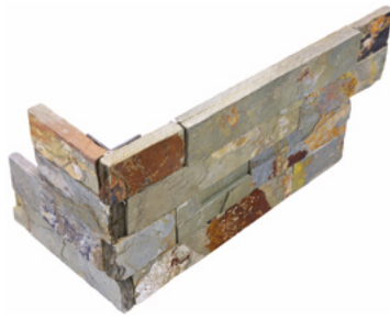
6 x 18 in / 15 x 45 cm Assembled Corner 5004-0020-0