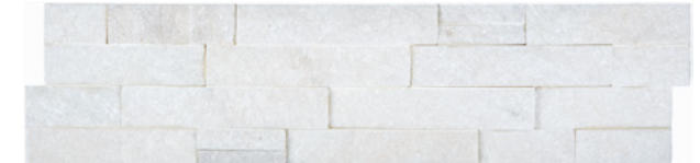
6 x 24 in / 15 x 60 cm Corner Panel 5004-0012-0